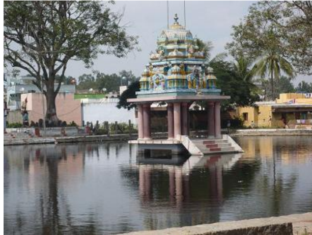
Fig. 2. View of the temple tank

elevated covered platform in granite slab. The Neerazhi mandapam gopura is constructed with bricks and decorated with suthai sculptures.